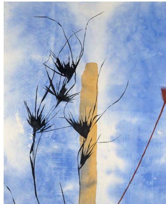
standing stone, kangaroo grass, red and yellow ochre (2020)