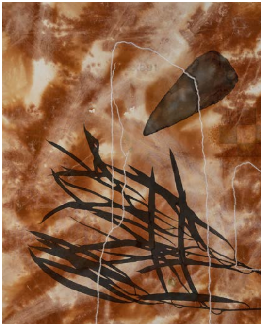
standing stones, gumbi gumbi, stone tool (2020)