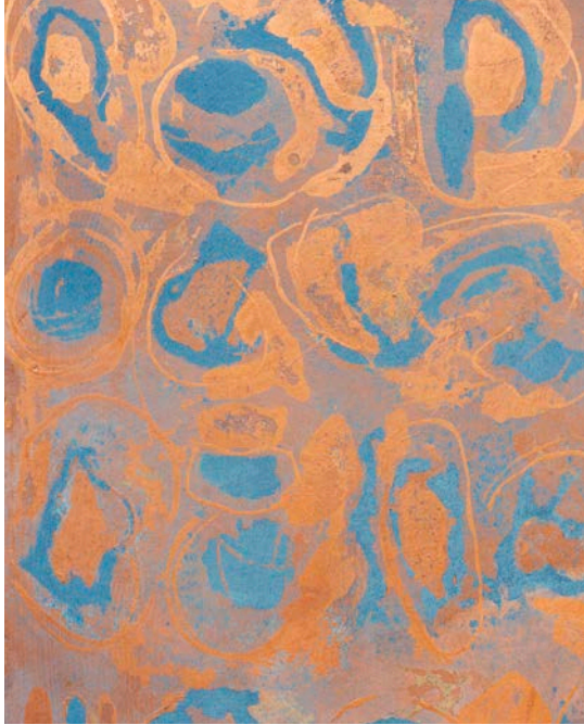
A Library of Ecological Conversations (Leaves and Me) (2017-2019)